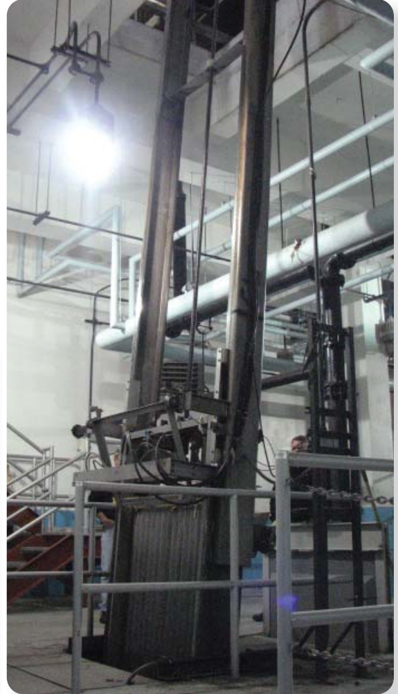
Extended Discharge Flo-Screen