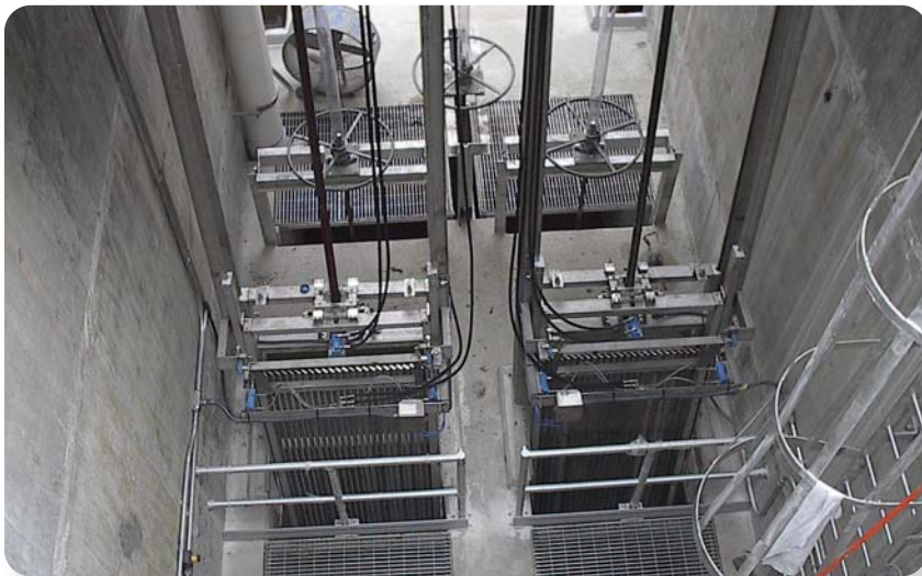
Maintenance-free Ball Screw Drive

With its unique angle bar design the Flo-Screen retains solids more efficiently than conventional bar screens by increasing the screen's surface area. An innovative saw-tooth rake removes more solids and grease buildup by increasing the rake-to-screen contact area. Between cleaning cycles, the rake is parked at the bottom of the channel in position to remove any gross solids that might otherwise cause other screens to jam.