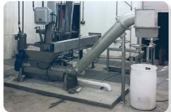
Flo-WashPress receiving screenings from an Enviro-Care Flo-Screen